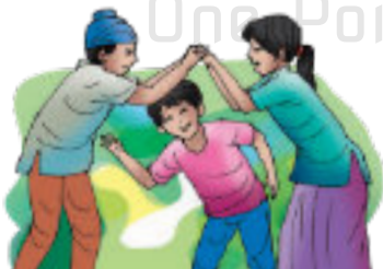
Chain game (Pakdam Pakdai / Chain Tag)