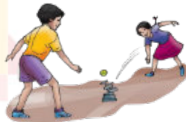
Lagori (Seven Stones)