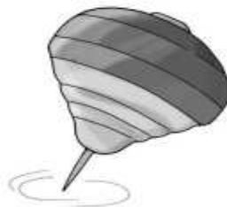
top/ Spinning top